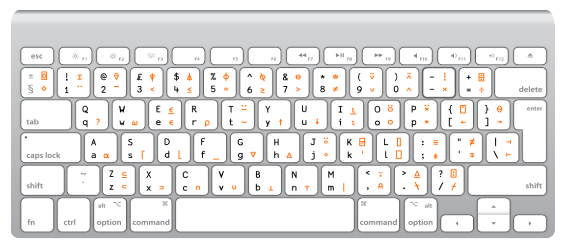
Figure A-1: The default Session keyboard key mappings (UK keyboard)

The keyboard key mappings shown in Figure A-1 are enabled whenever a Dyalog Session is started.